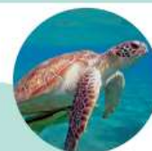
Glavata kareta • Tartaruga • Caretta caretta • Loggerhead Sea Turtle Caretta caretta