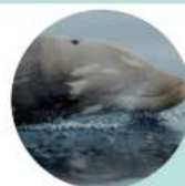
Cuvierjev kljunati kit • Zifio • Cuvier's Beaked Whale Ziphius cavirostris