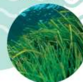
Pozejdonka • Posidonia oceanica • Neptune Grass Posidonia oceanica