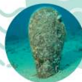
Veliki leščur • Nacchera di mare • Noble Pen Shell Pinna nobilis