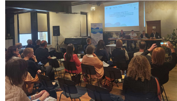
Photo: Mediterranean Coast and Macro-Regional Strategies Week 2024